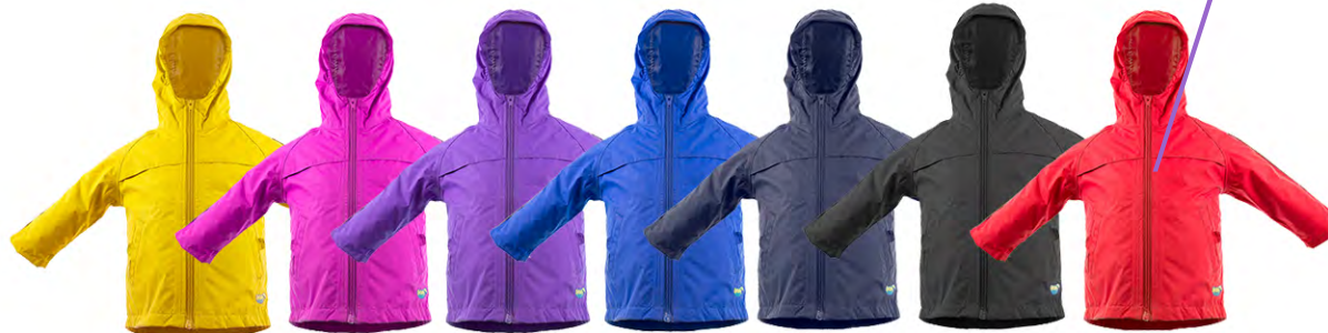
Yellow Hot Pink Purple Royal Blue Navy Black Red

Sizes: 2T, 3T, 4T, 4, 5/6, 6X/7, 8, 9/10, 11/12