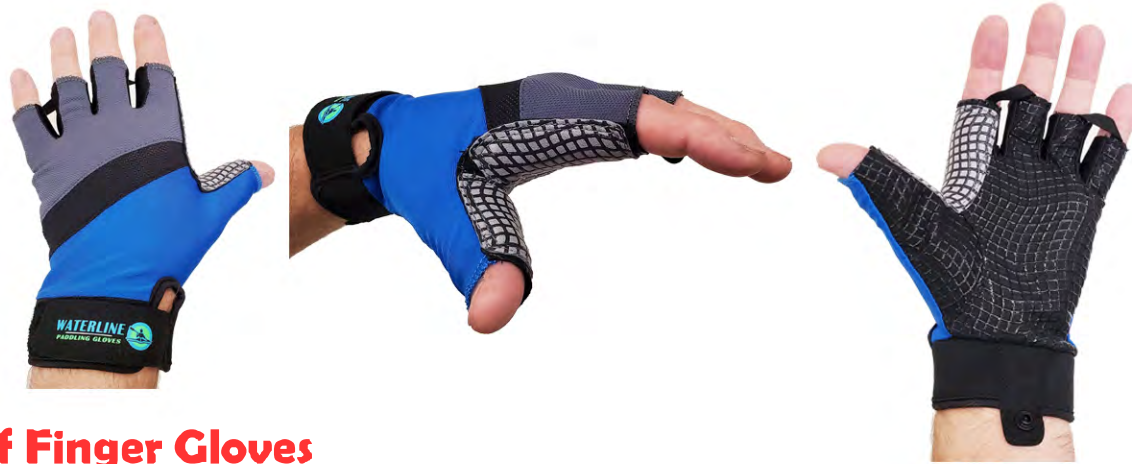
Half Finger Gloves