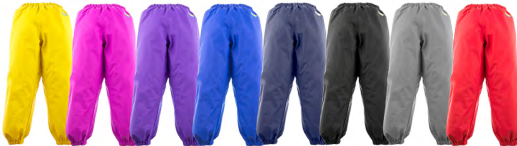
Yellow Hot Pink Purple Royal Navy Black Gray Red

Sizes: 18-24 months, 2T, 3T, 4T, 4, 5/6, 6X/7, 8, 9/10, 11/12