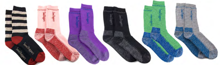
B&W Stripe Pink & Red Purple & Gray Black & Gray Green & Blue Gray & Blue