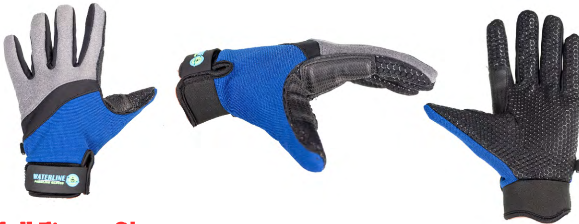
Full Finger Gloves